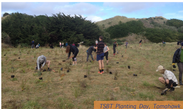
TSBT Planting Day, Tomahawk